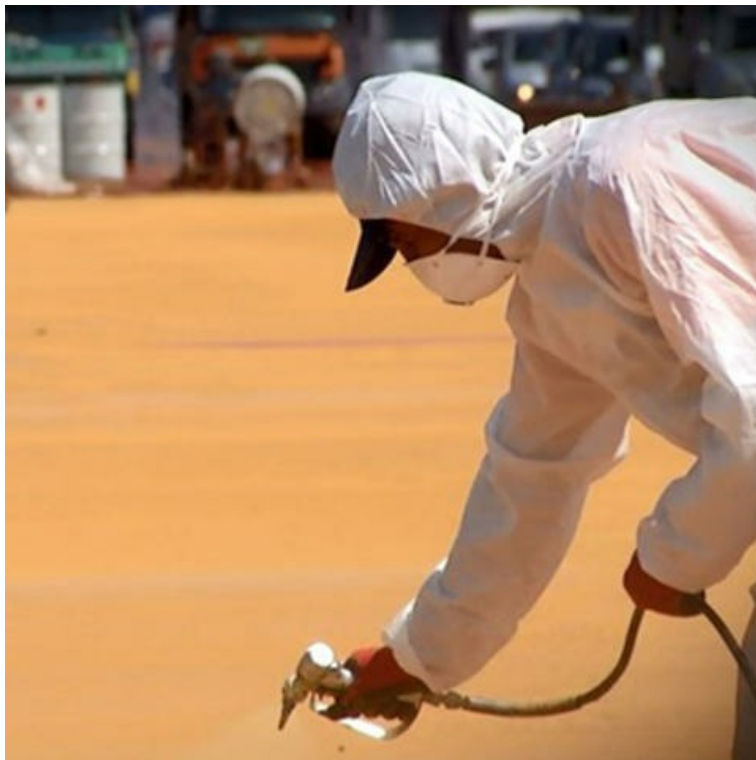
Iconic bridges use ELIMINATOR ® waterproofing