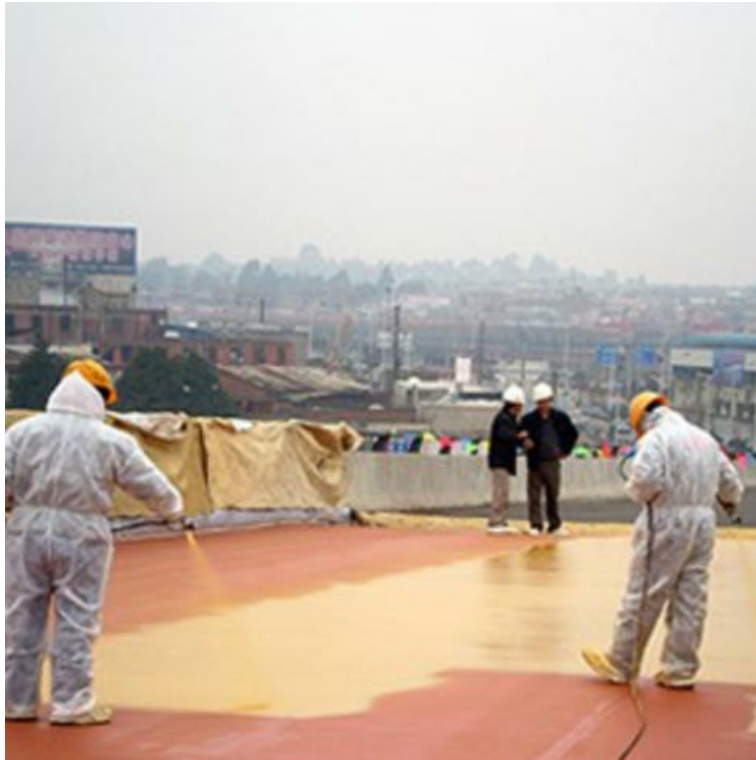
Kunluo Road Interchange Gets New Lease of Life