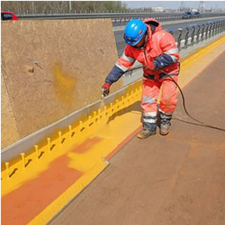
ELIMINATOR ® overcomes tough environmental challenges