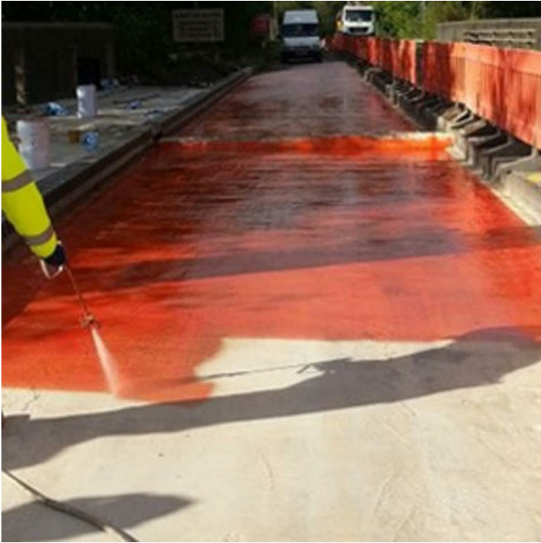
Crumlin Bridge Protected with Spray Applied Waterproofing