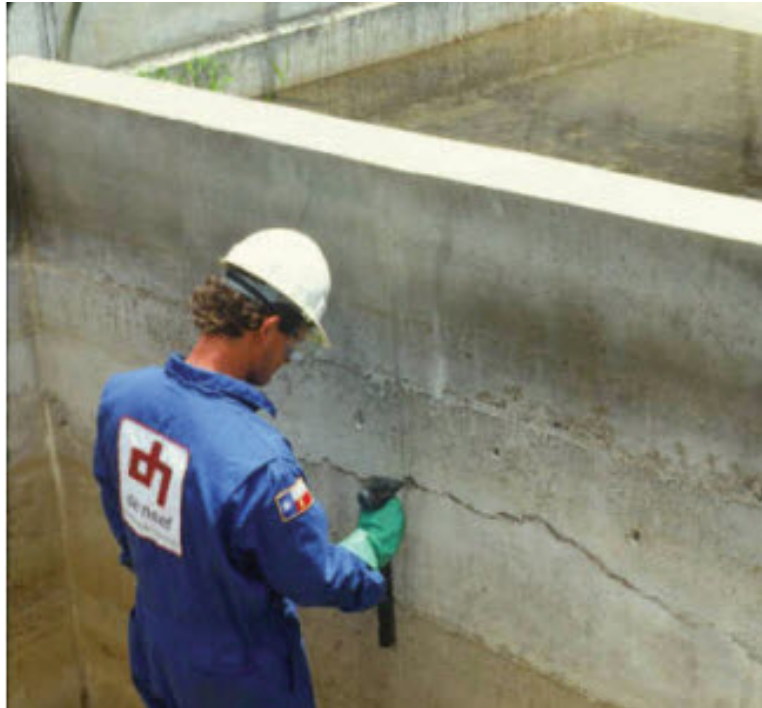
Figure 1. Preparing the crack..

Ports are alternated from side to side to ensure intersection of the crack as well as to prevent a weak side of the crack.