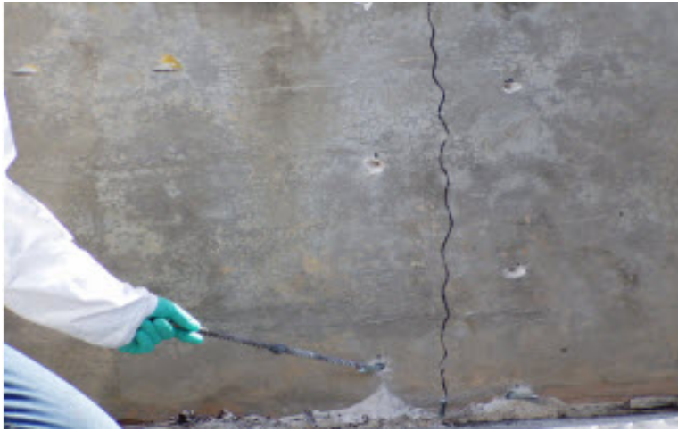
Figure 5. Installation of packers