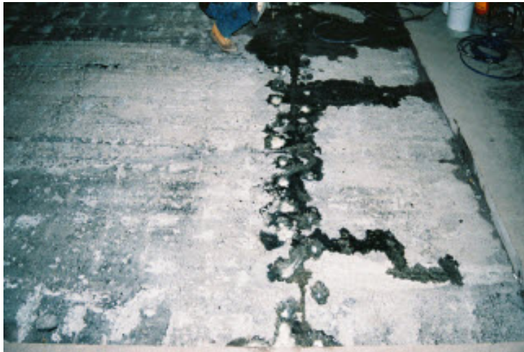
Figure 11. Port to port grout show