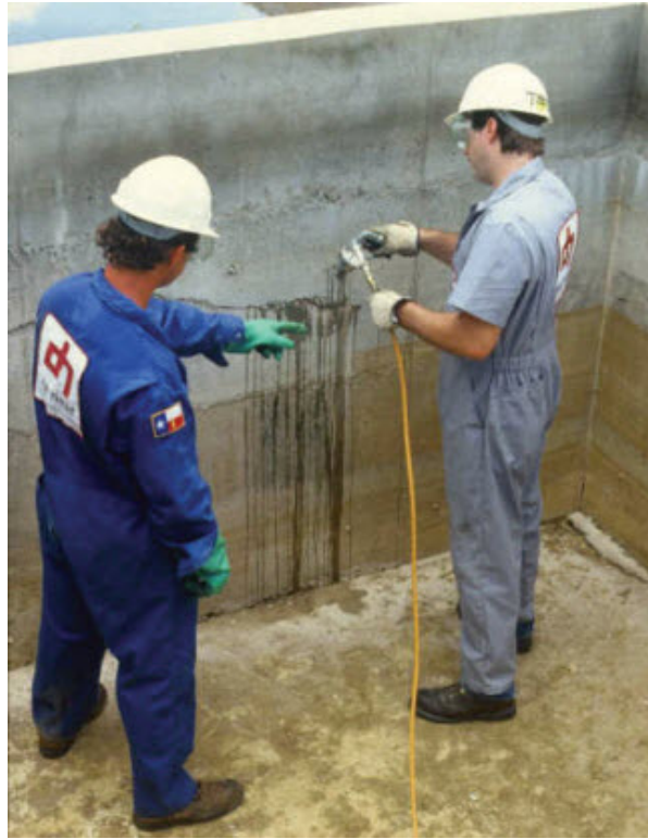
Figure 8. Flushing crack with water.