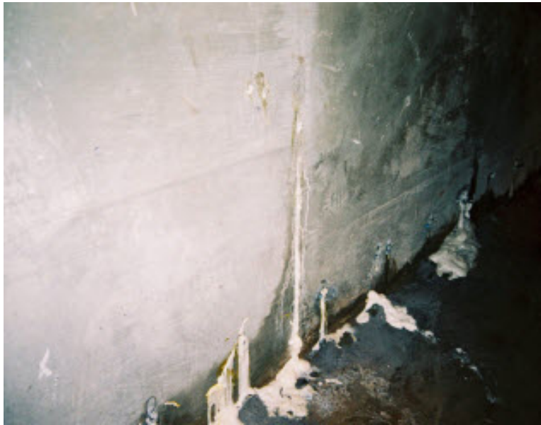
Figure 9. Grout travel up vertical crack.