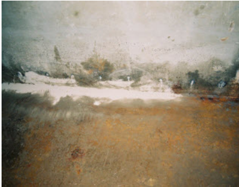
Figure 12. Dry, grouted joint.