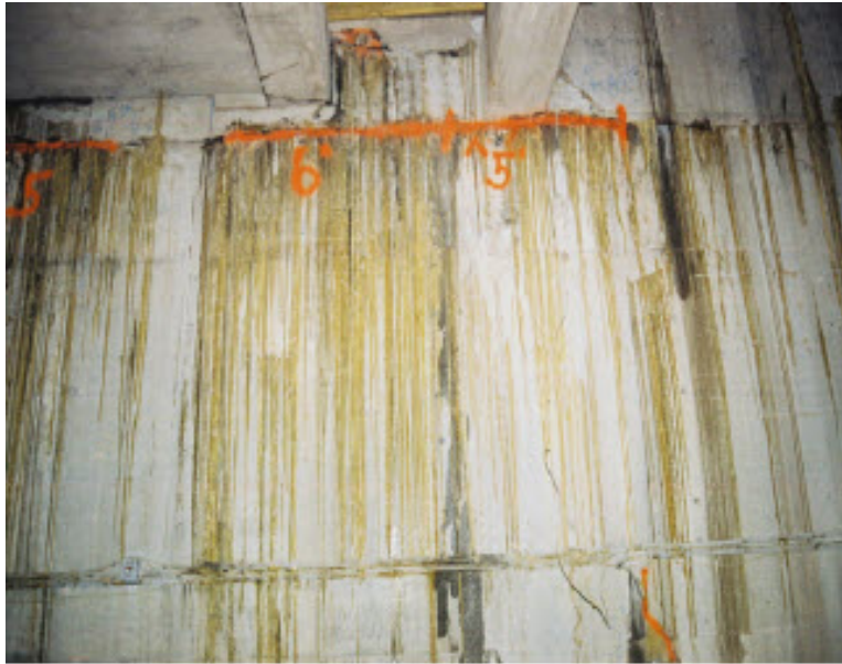
Figure 10. Port-to-port continuity.