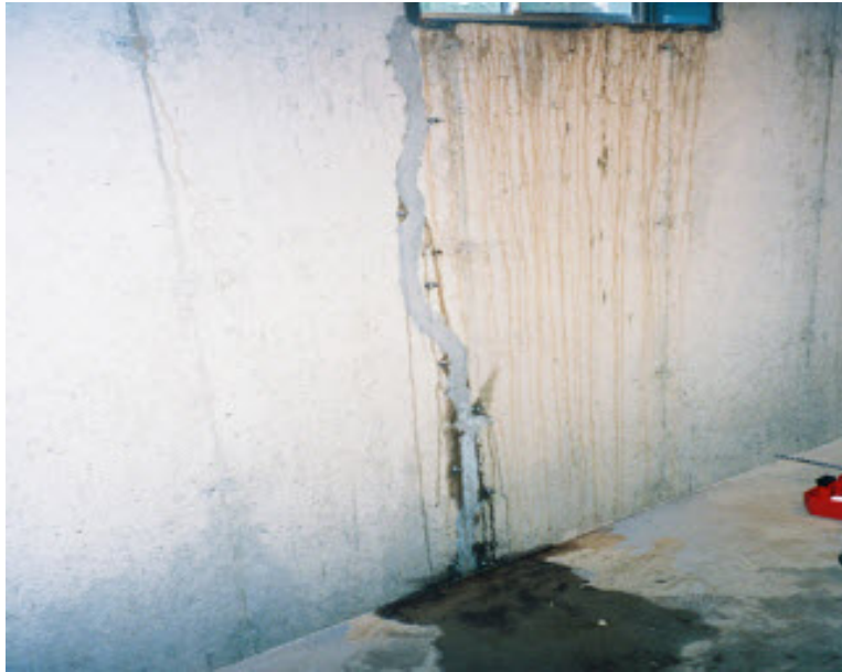
Figure 3. The lines show the port spacing. Closer at the bottom where the crack is tighter, further apart at the top where the crack widens.