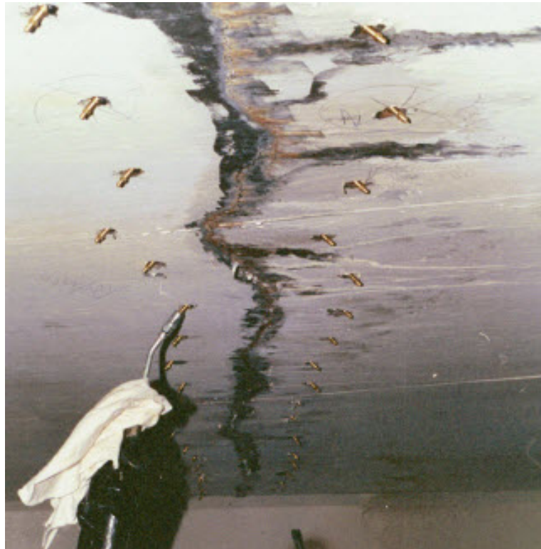
Figure 6. Drill pattern on overhead crack.