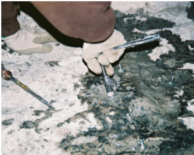
Figure 4. Drill hole pattern.