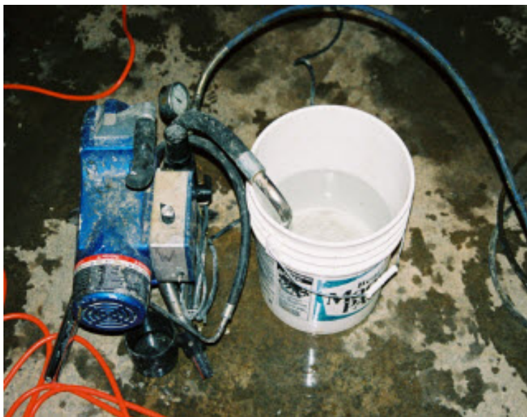
Figure 13. Always flush lines thoroughly.