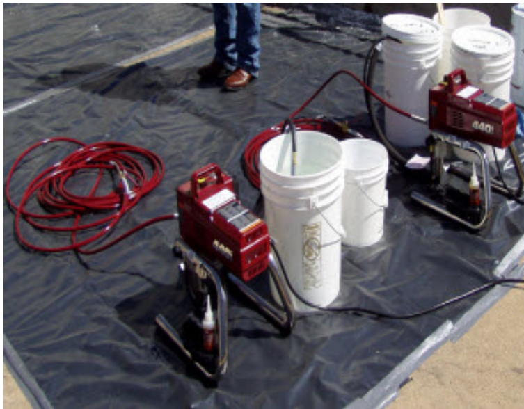
Figure 7. Two pumps: one for water and one for grout.