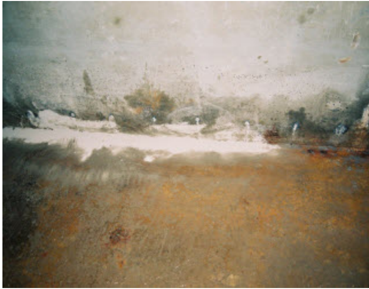
Figure 12. Dry, grouted joint.