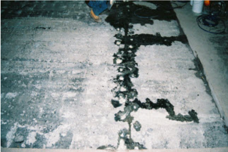
Figure 11. Port to port grout show