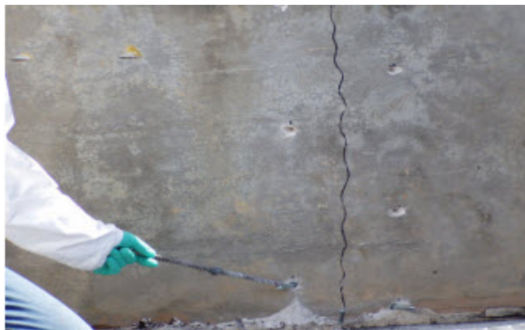
Figure 5. Installation of packers