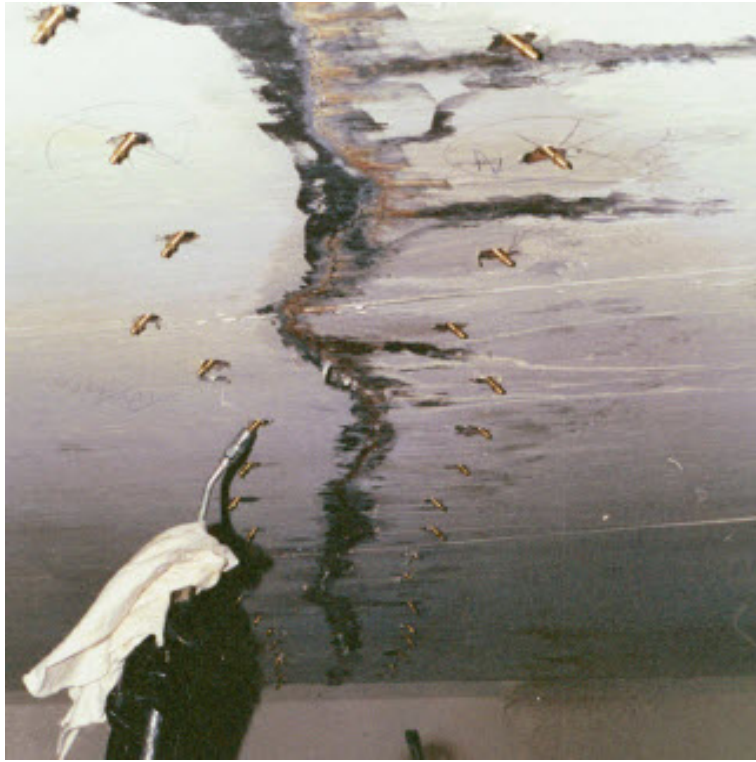
Figure 6. Drill pattern on overhead crack.