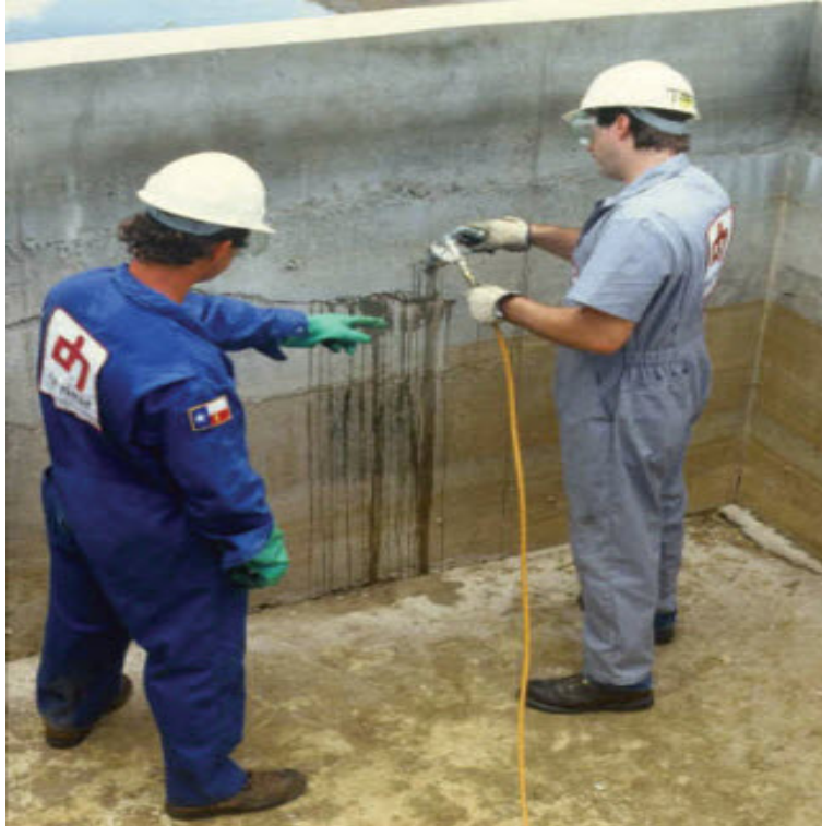
Figure 8. Flushing crack with water.

Note: Injection pressure will vary from 200 psi to 2500 psi depending on the width of the crack, thickness of concrete and condition of concrete.