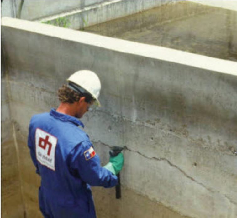
Figure 1. Preparing the crack..

Ports are alternated from side to side to ensure intersection of the crack as well as to prevent a weak side of the crack.